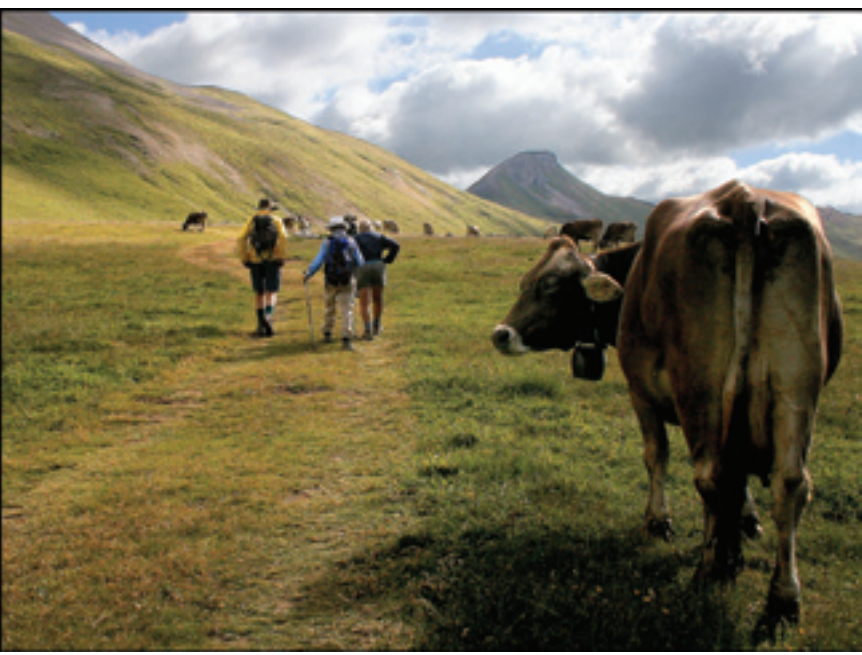
Hikers with cows