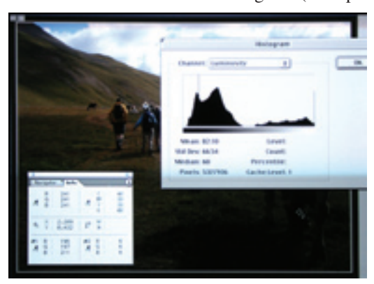
Figure 1. Original Histogram and Info palettes

With this setting, often the sky was properly exposed but the ground underexposed. When I open an image in PhotoShop, the first step is to correct the exposure. I start with an "image adjust threshold" command and move the pointer to the white part of the histogram. Watching the white areas disappear, I move the mouse to a point illuminated in the image that I wish to be white and record its brightness in the info pallet with a shift click of the mouse. I repeat for a black point and then push CANCEL to return the image to normal. Then I select areas where I want to increase contrast and correct exposure with a