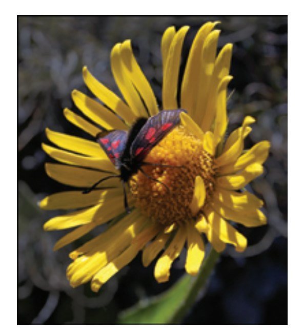
Mountain Burnet Moth (Zygaena exulans) feeds on compositae sp.

For example, in Hikers with Cows , I set the white (my friend's hat), and black points (the cow's tail) with the threshold command in the ground portion of the photo (Figure 1). I selected only the lower part of the photo with a selection tool, to adjust the exposure leaving