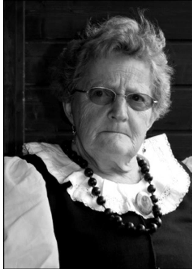
Swiss lady in costume