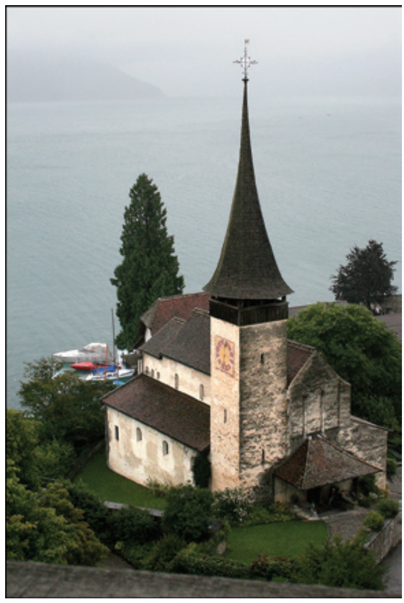
Chapel viewed from tower of Spiez Castle.