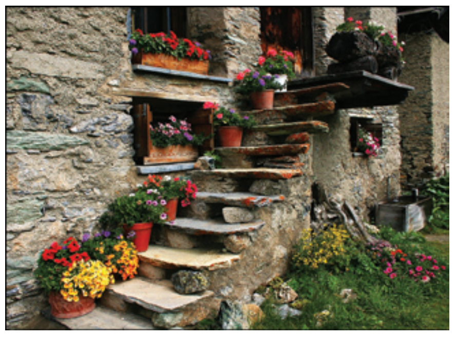
Flowered stairs, Blaunca, Switzerland.