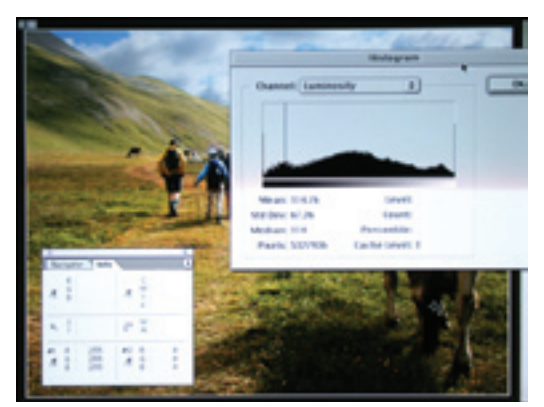
Figure 2. Final Histogram and Info palettes