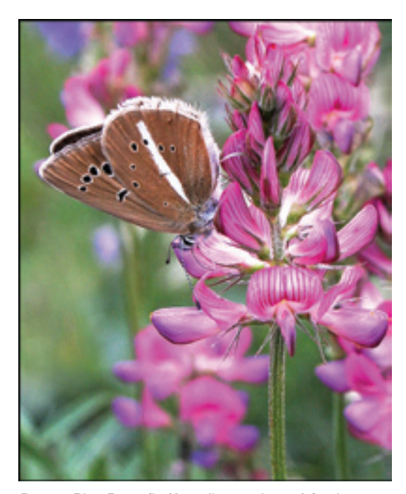
Damon Blue Butterfly (Agrodiaetus damon) feeds on sole food source, sainfoin (Onobrychis viccifolia).

selection tool. (Usually this is everything but the sky.) I make an adjustment layer and then move the sliders in the red, blue and green windows to make the whites, 255 and blacks, zero. This makes a satisfactory image. Further adjustments can refine the image, if necessary, such as color, contrast and saturation in other layers.