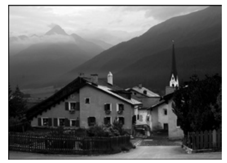
Zuoz at 7:10 a.m. taken with a Digital Rebel XT. (Tripod mounted, f10 18-55 Canon EF-S lens)