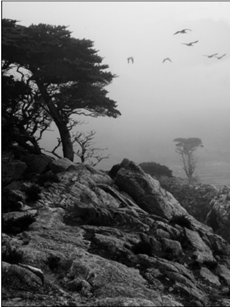
Cypress Point fog