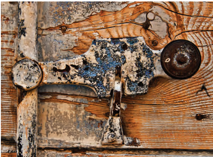
Latch in Céreste

Lourmarin, the former home of Albert Camus,