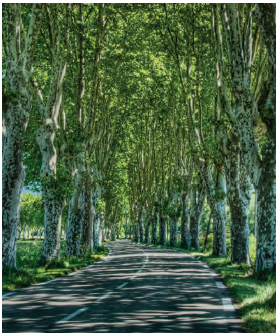
Plane tree avenue